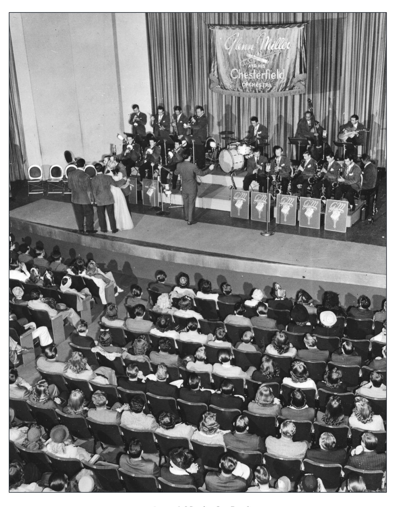
America's Number One Band Chesterfield Moonlight Serenade Hollywood 1942