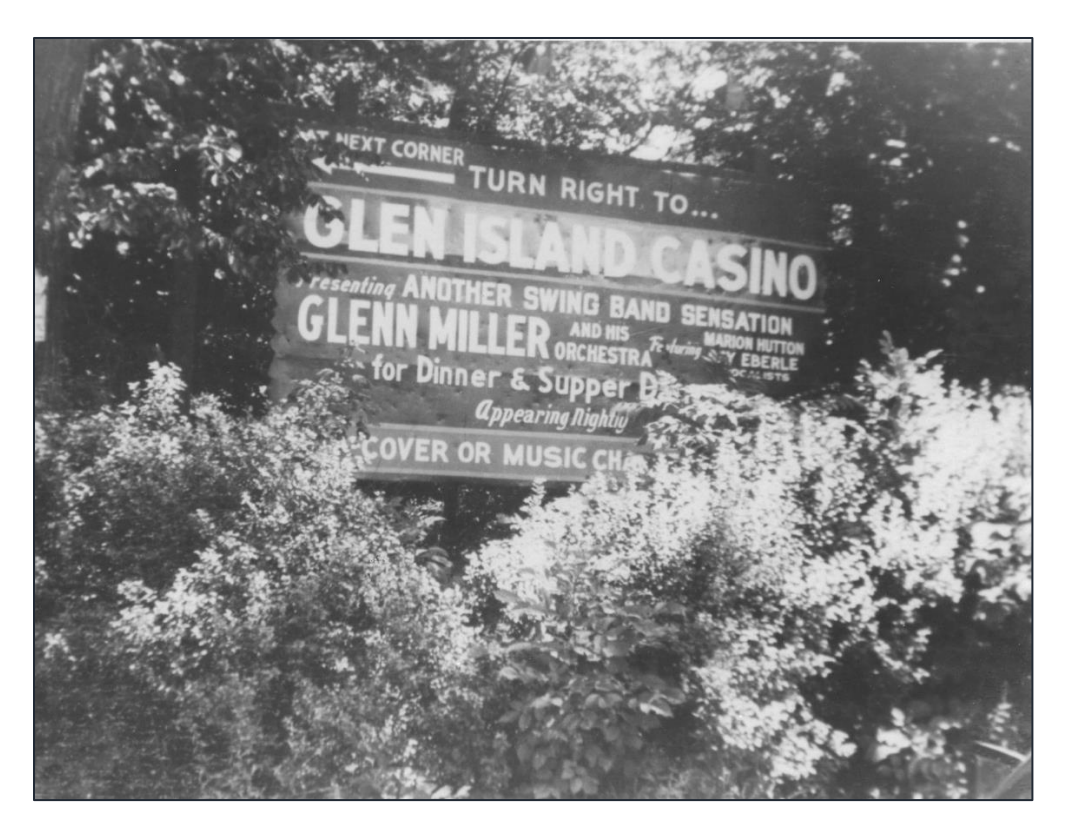
"Along the Waters of Long Island Sound"