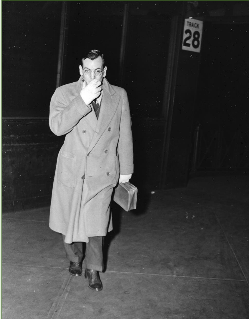
Glenn Miller, Penn Station, New York