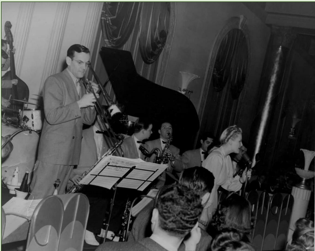
Glenn Miller and his Orchestra with Marion Hutton singing Café Rouge, Hotel Pennsylvania, New York, January-April 1940

Before Artie Shaw's decision became public, Jerry Gray put out feelers and Glenn Miller pounced. Until now, Miller's full time arranging staff consisted of the talented Bill Finegan, supported by a distracted Miller, busy with many other matters. Glenn hired the renowned black musician Eddie Durham part-time to write important arrangements in 1939 that continued to propel the band into 1940. Although they did not know it at the time, the collaboration of Miller and Gray became "a marriage made in heaven." The historic alliance eventually produced a significant output of America's popular music during the 1940s. Gray was a fast, accurate, neat and prolific arranger. His personality and style greatly complimented Miller as well as Finegan and, later, Billy May. To the everlasting frustration of Artie Shaw, Gray's tenure with Miller was not temporary. He remained as Miller's close if not closest musical confidante until Glenn's untimely passing and beyond. Therefore, Artie ironically helped to solidify Glenn's success and ultimate legend. He gave Glenn the opportunity to enlist Jerry Gray, who became an essential component of the Miller juggernaut.