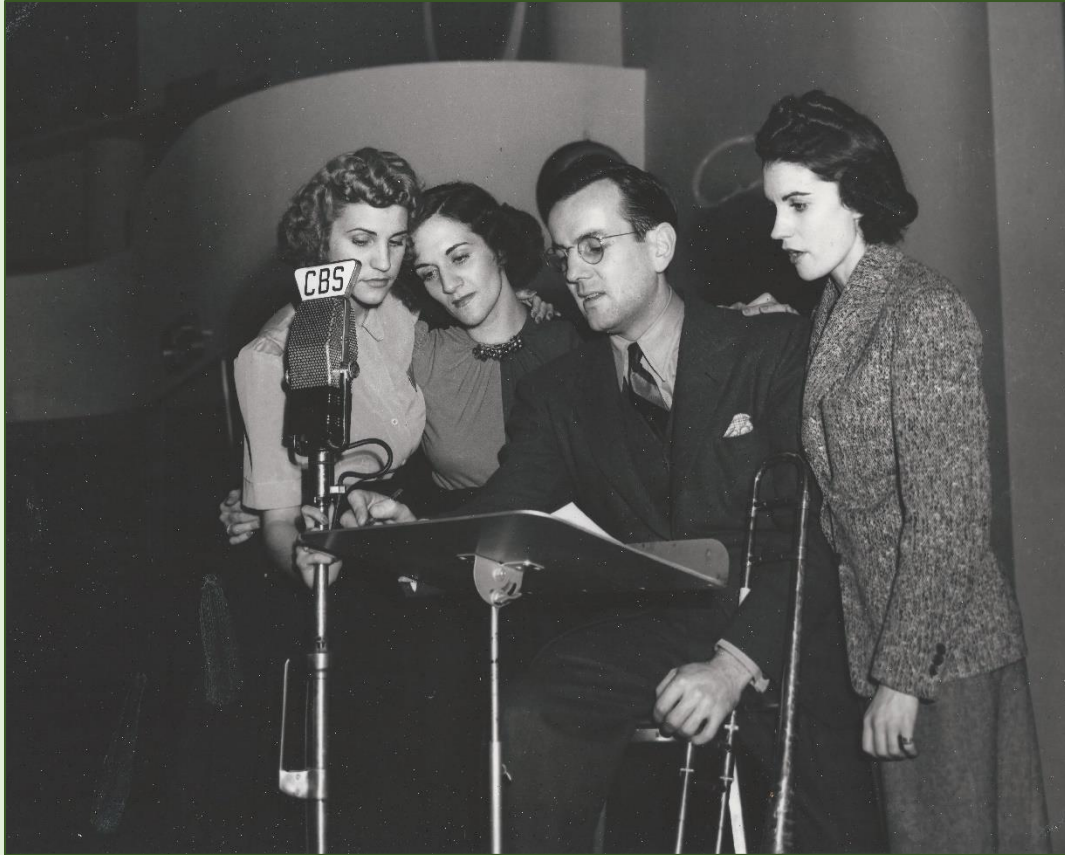
Glenn Miller with the Andrews Sisters at CBS, January 1940