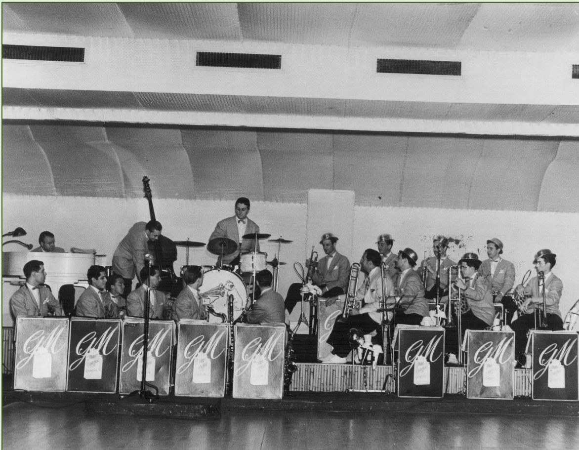
Glenn Miller and his Orchestra – Summer 1940 Panther Room, Hotel Sherman, Chicago, Illinois (note: drum set and bandstands promote RCA records and Chesterfield)

At soda fountains, diners, restaurants, clubs, pubs, student unions, drugstores and arcades, Americans dropped nickels into jukeboxes to hear the latest popular records. During the summer of 1940, those records were inevitably Glenn Miller's. Little wonder that the 1941 and 1942 hit songs "Nickel Serenade" and "Juke Box Saturday Night" memorialized Miller's status as jukebox king. And in homes from coast-to-coast, Miller's primetime network program, late-night remote broadcasts and records entertained millions. The band traveled to the Midwest and a new home base of Chicago, where another CBS-owned station, WBBM, originated the Chesterfield broadcasts. Eager audiences from Ohio and Michigan to Missouri and Kansas had an opportunity to see, hear and dance to the band in person. In Glenn's native "cousin country," the band broadcast from Lincoln, Omaha and, on the Fourth of July, Des Moines, while also appearing in Cedar Rapids and Clear Lake.