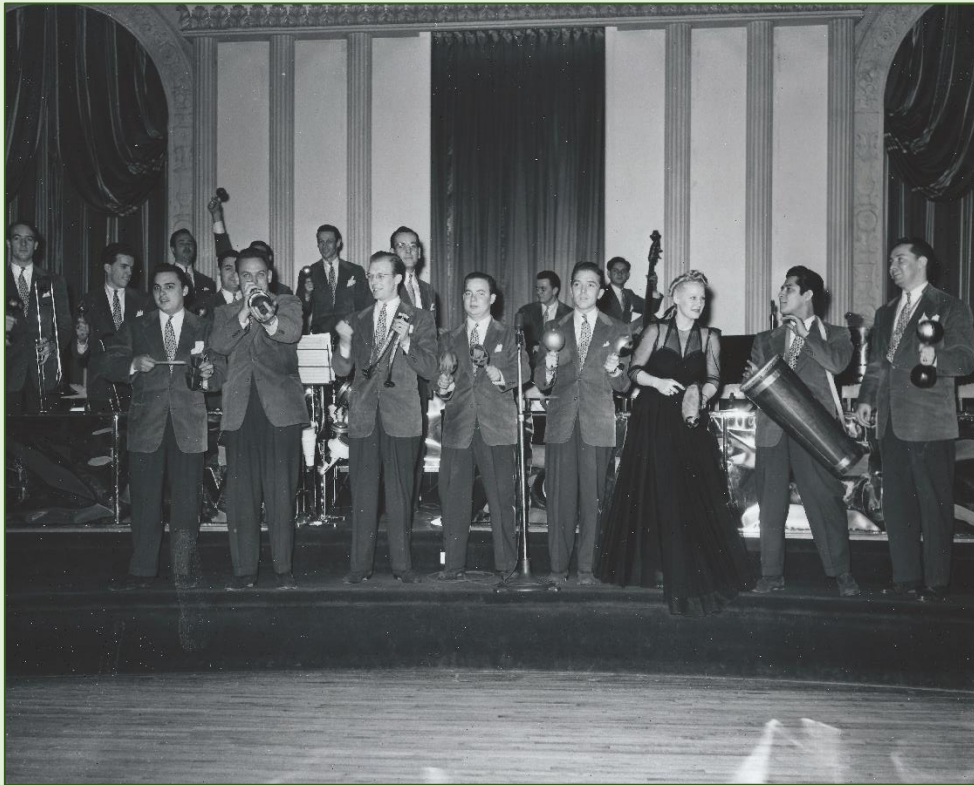
Latin American Specialty, Café Rouge. November 1940