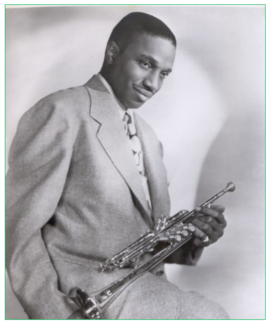
Oran "Hot Lips" Page