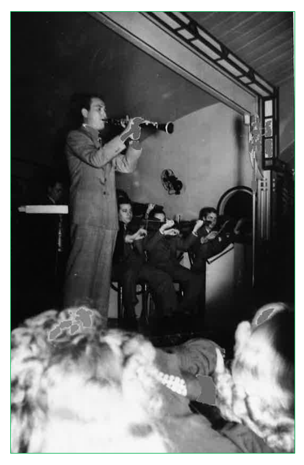
Artie Shaw Unidentified Location Probably October 1941