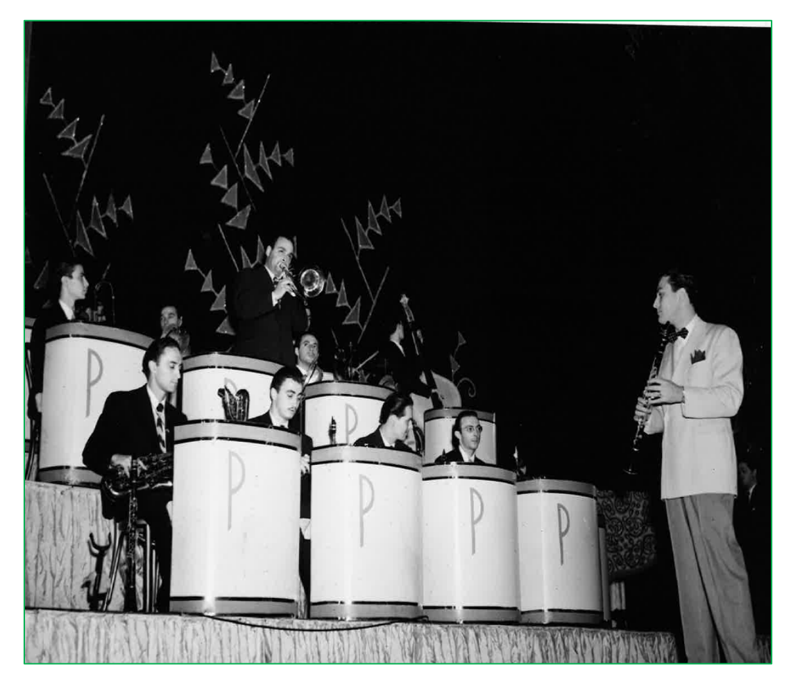
Undated Unidentified Location (Reinhard Scheer-Hennings Collection)