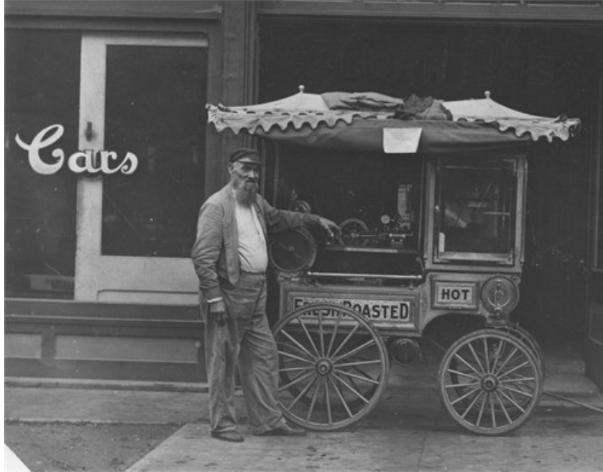
Robert Albert "Popcorn Bob" Miller Grandfather of Alton Glenn Miller