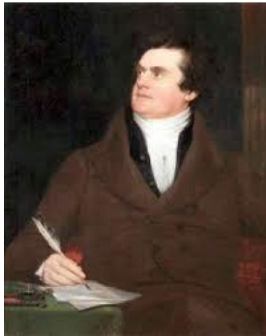
Gov. William Leete