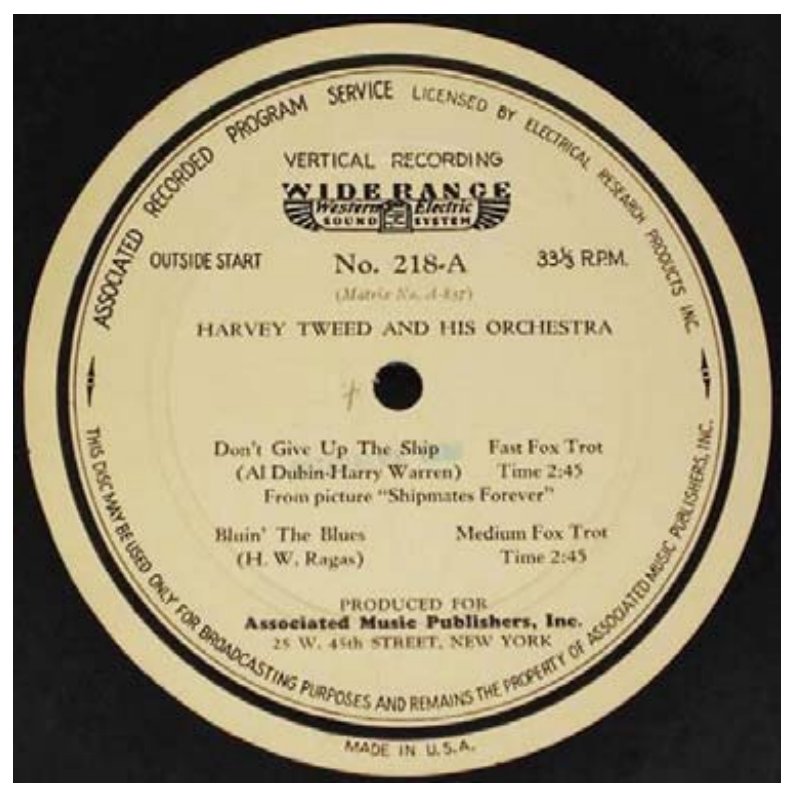
Electronic Transcription - November 14, 1935

Associated Recorded Program Service Transcription Recording Session November 14, 1935 (Thu) Electrical Research Products, Inc. Bronx, New York