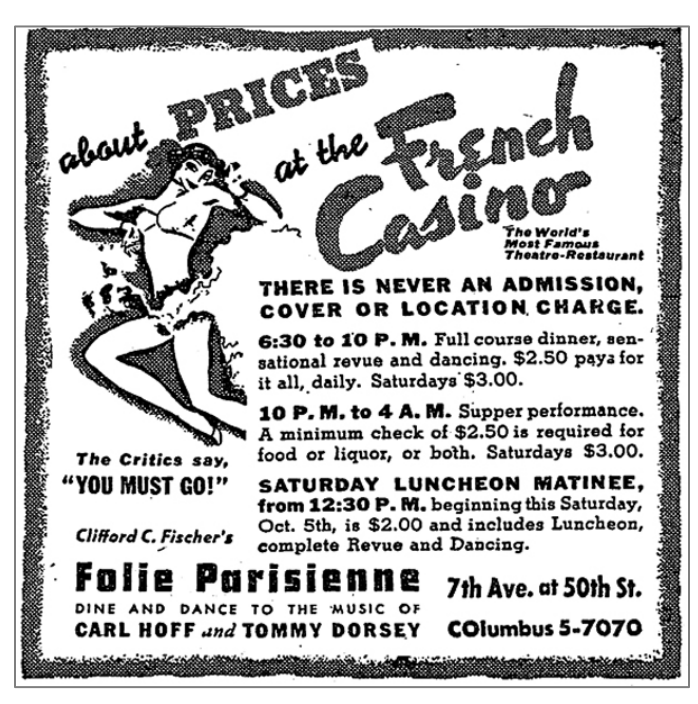
The French Casino