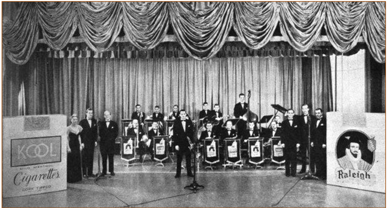
Tommy Dorsey and his Orchestra Raleigh-Kool Program