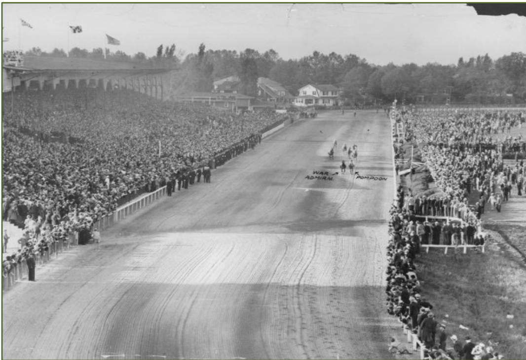
War Admiral wins the 1937 Preakness at Pimlico En-route to sweeping the Triple Crown