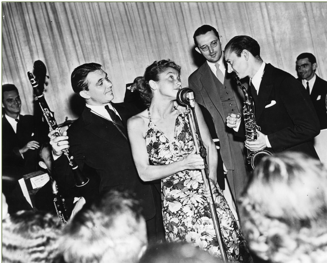
Palm Room, Hotel Commodore