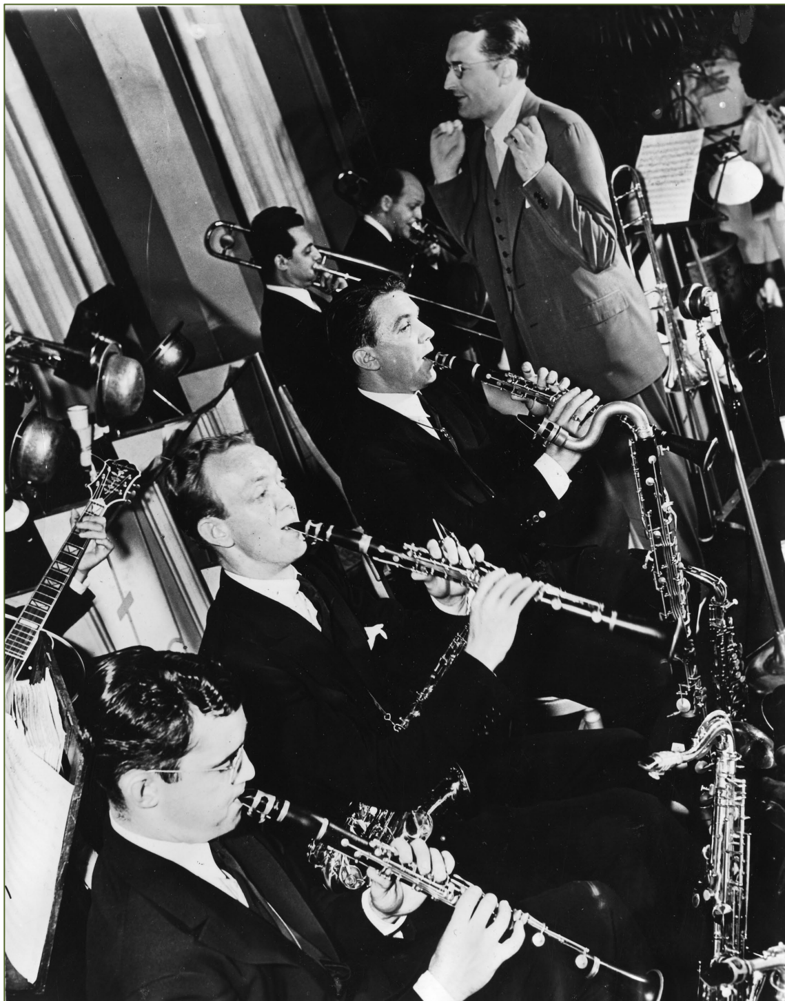
Palm Room, Hotel Commodore