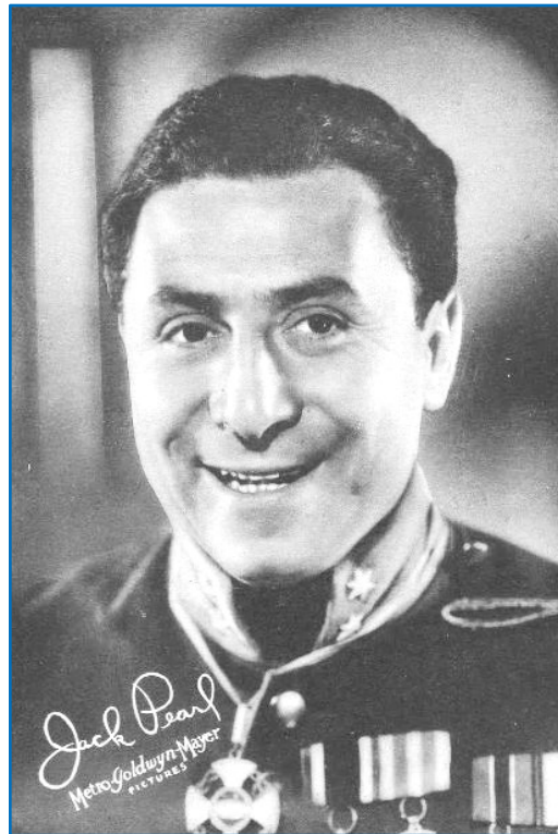
Baron Munchausen (Jack Pearl)