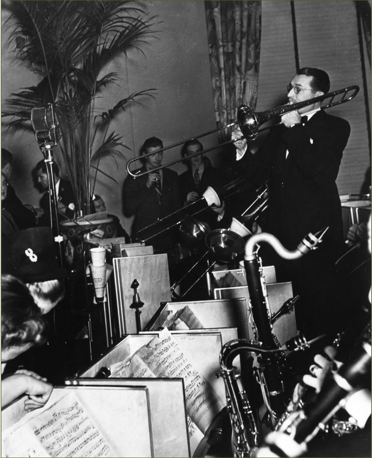
Palm Room, Hotel Commodore