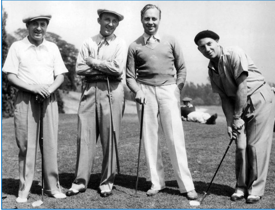
Jack Pearl, Bing Crosby, Jack Benny and Chico Marx