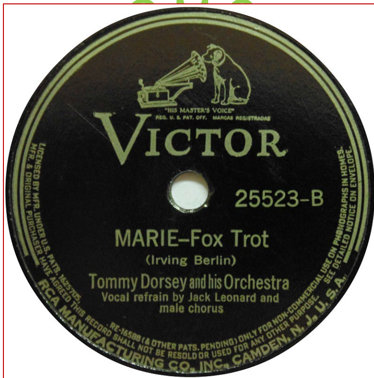
The Popular "Twins" That Led to "Fame and Fortune"