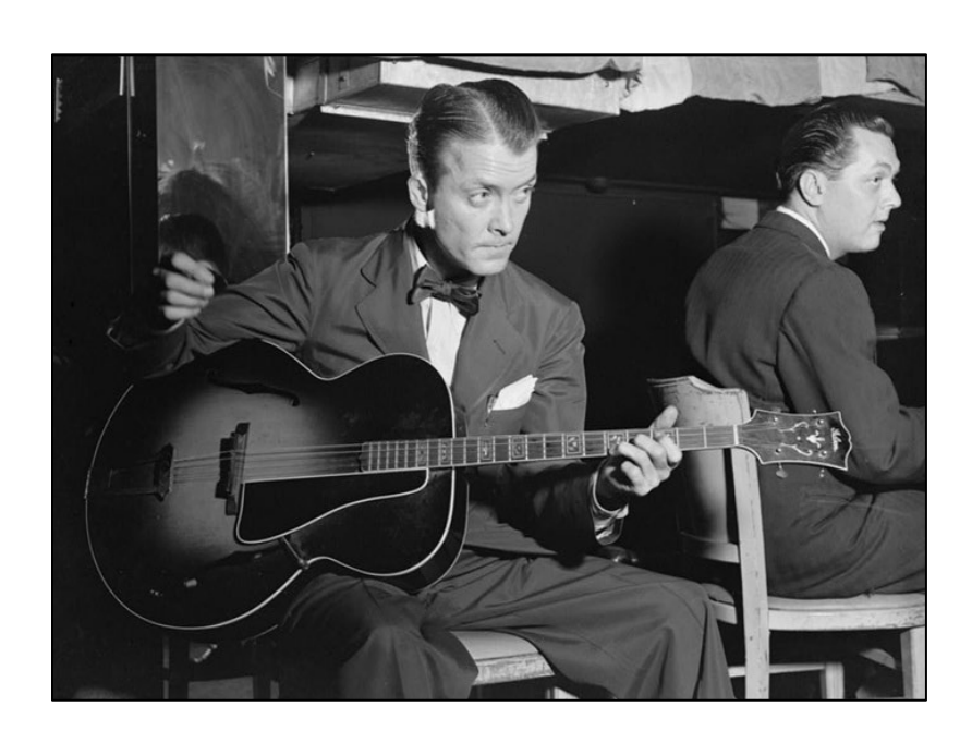
Eddie Condon