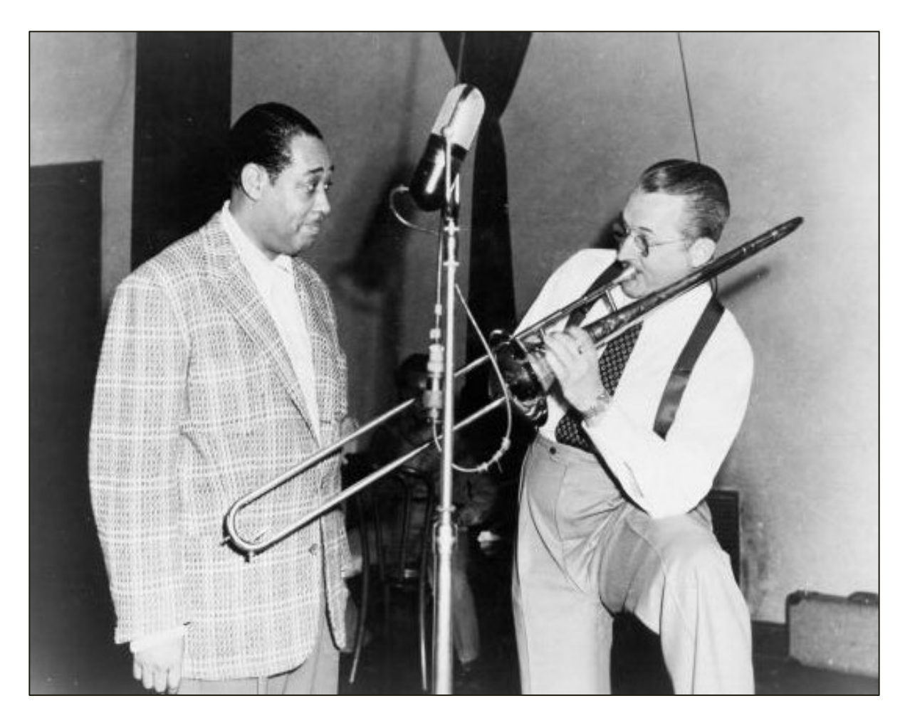
Duke Ellington and Tommy Dorsey "Double Feature"