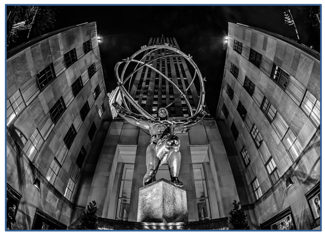
NBC Blue Network WJZ NBC Radio City Rockefeller Center – New York