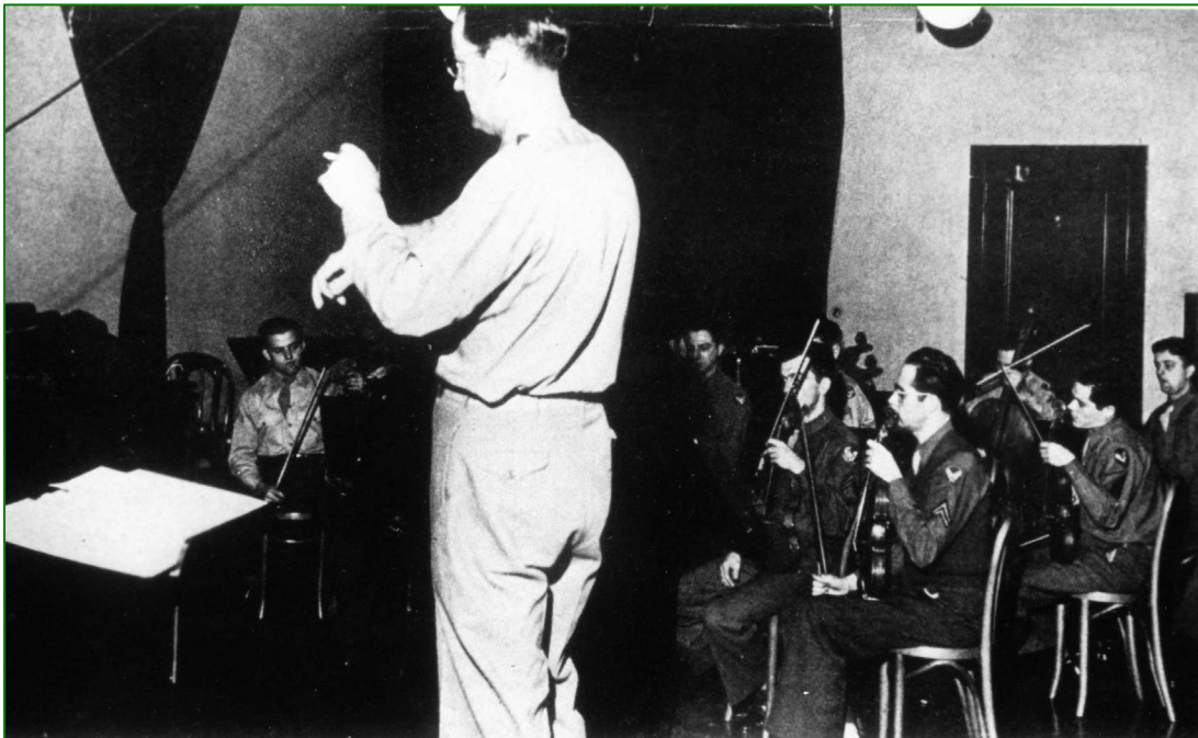
Capt. Glenn Miller and the Army Air Forces Training Command Orchestra V-Disc Recording Session, RCA Studios, New York October 29, 1943