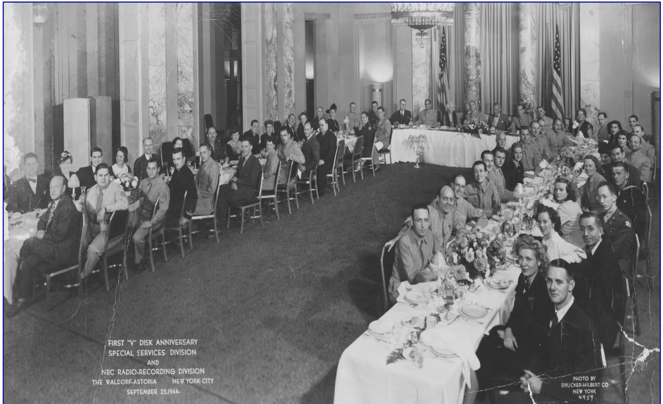
V-Disc First Anniversary Dinner, September 25, 1944 Waldorf-Astoria Hotel, New York All of the V-Disc Personnel are present in this photograph