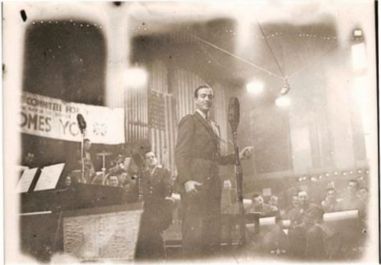
Lt. Col. David Niven announcing as Capt. Glenn Miller listens AEFP, Corn Exchange, Bedford, July 1944