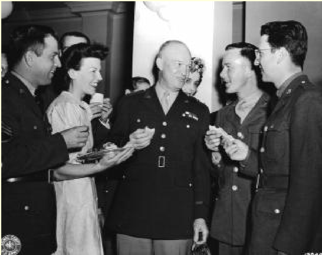
Gen. Dwight D. Eisenhower, Supreme Commander, Allied Expeditionary Forces American Red Cross Club in London, 1943