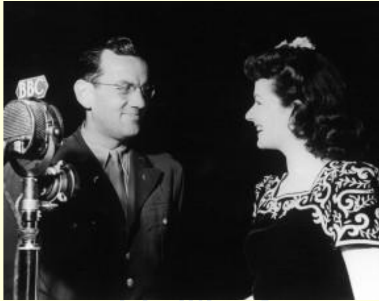
"Variety Bandbox", July 30, 1944, Capt. Glenn Miller and British star Margaret Lockwood