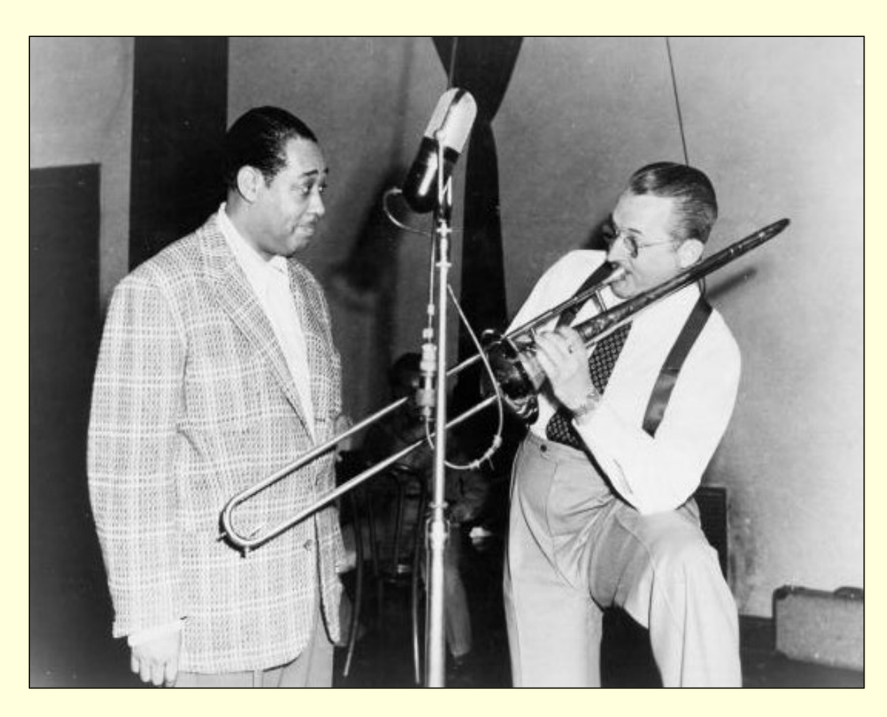
Duke Ellington and Tommy Dorsey "Double Feature" (GMA Ed Burke Collection)