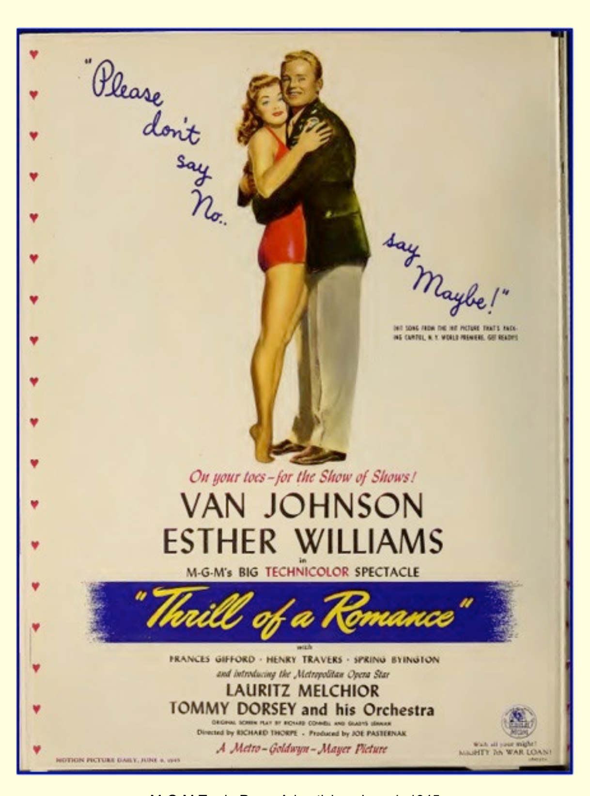
M-G-M Trade Press Advertising, June 1, 1945